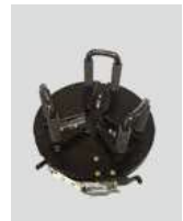
Universal holder Corresponds to container sizes φ220 to φ300