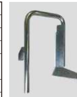
Mixing vane for normal rotation With Teflon® packing